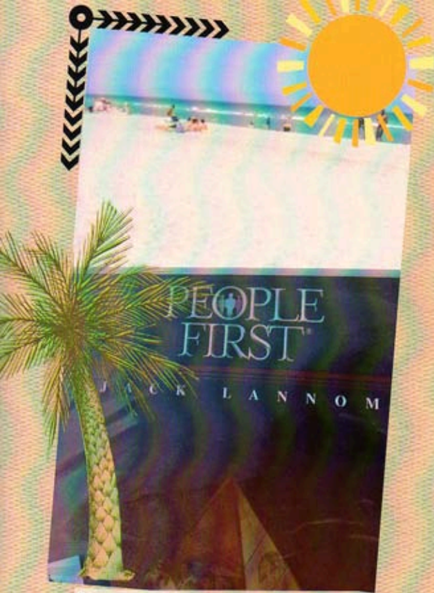
People First at the beach